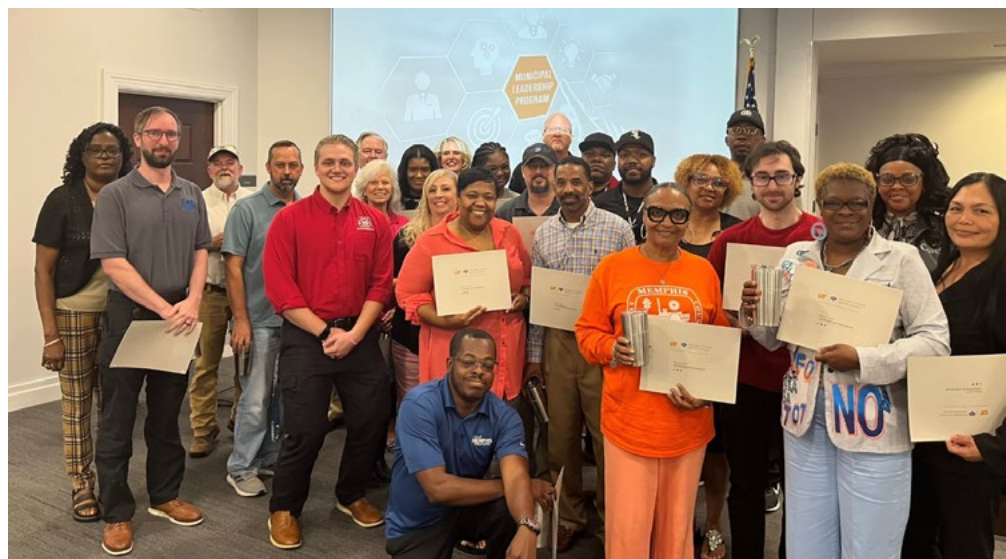
West Tennessee/Somerville, TN cohort of the MTAS Municipal Leadership Program 2024.