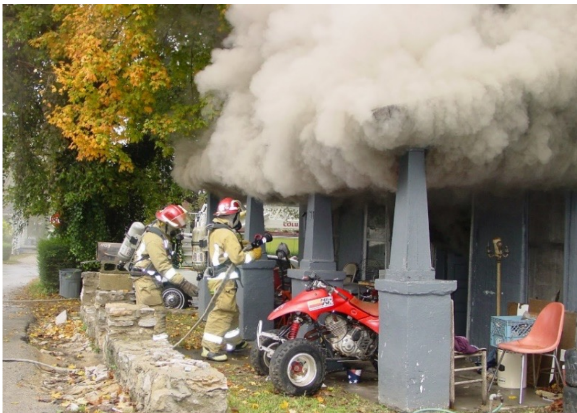
Firefighters preparing for primary search assignment.

For further assistance in meeting the act's requirements in your municipality, contact MTAS Fire Management Consultant Steve Cross at steven.cross@tennessee.edu .