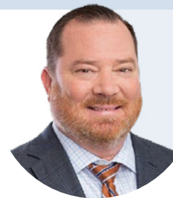
Del Sable MTAS Training and Development Consultant

The program prepares leaders to manage current and future workforce needs and positively influence organizational success. MLP is offered regionally for open enrollment and includes four