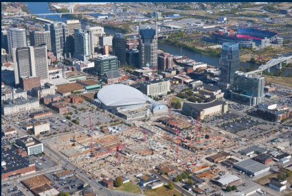
Used according to provisions of Nashville-Davidson County.

In 1778, James Robertson of the Watauga settlement in what was then North Carolina, scouted the Nashville area with eight men and within 2 years the first civil government in Middle Tennessee was signed by 256 men. They named the settlement Nashborough for General Francis Nash of North Carolina. Nashborough was changed to Nashville in 1784.