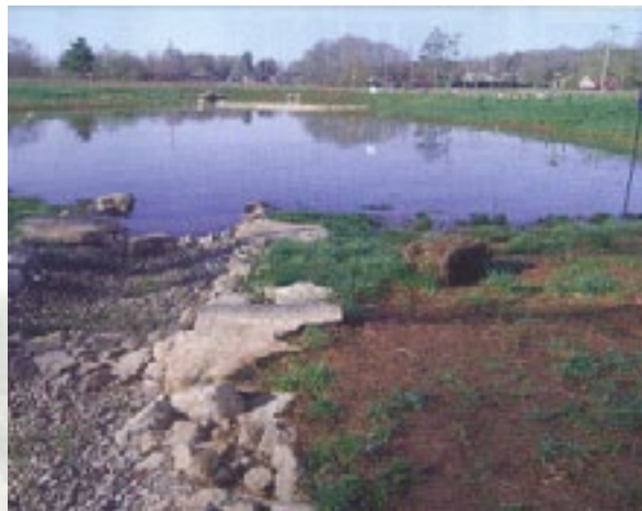
The Oostanaula Creek in Athens

The Athens Public Works Department was awarded a 319 Grant by the Environmental Protection Agency in 2009 for the purpose of restoring Oostanaula Creek. When one of our original projects was rejected, we quickly sought alternatives and pitched the idea of wetland restoration to the library board. Naturally, they were skeptical, and rightly so. Visions of soggy books, snakes and mosquitoes danced through their heads. However, with the help of a consulting firm, we were able to convey the positive and tangible results of our proposal, and the library board agreed to allow a new wetland to be constructed on the property.