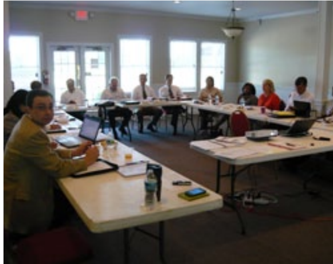
MTAS staff meet with representatives from the 10 cities participating in the Tennessee Municipal Benchmarking Project in Franklin.

MTAS will facilitate the efforts of the participating cities as they work to improve services to their communities: Athens, Bartlett, Brentwood, Chattanooga, Cleveland, Collierville, Franklin, Germantown, Kingsport and Morristown.