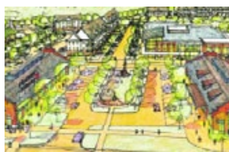
Submitted drawing of the Jackson City Walk

our downtown. We are especially appreciative to West Tennessee Healthcare for making such a significant commitment by locating their LIFT facility within the City Walk development.”