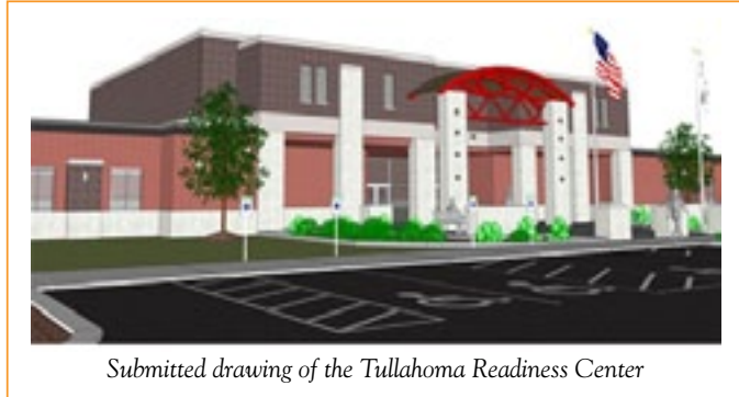
Submitted drawing of the Tullahoma Readiness Center

ICT modeled the HVAC energy usage for different types of systems, with the goal of LEED Silver-NC version 2.2 in mind. A water-source heat pump system with dedicated 100 percent outside air seemed to be a good fit to provide the required compartmentalization and still allow the number of thermostat control points that would be necessary for comfort.